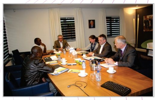
Brokering the deal with Hendrix Genetics representatives

a company that sells incubators. InCIP therefore bought an incubator which has a substantial capacity to incubate over 60,000 eggs. This incubator will serve an important function in the growth of the IC in the country and replaces a small capacity incubator previously used at the IPRU. Hendrix Genetics will also supply InCIP with male grandparents stock of Rhode Island Red (RIR) from the Institute Selection Animale B.V. Villa "de Kover Spoorstraat for experimental crossbreeding with IC. INCIP