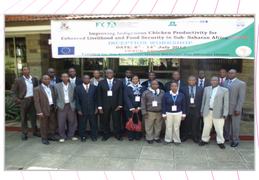
Partcipants during InCIP inception workshop

target groups that includes small scale f a r m e r s, orphans and widows of the SSA. The collaborative programme