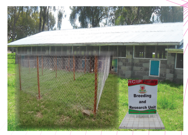
A section of InCIP Poultry Breeding and Research Unit

ompletion and operation of the InCIP Poultry Research Unit (IPRU) is a great milestone in poultry research in Kenya and the region. The Unit will be housing a state of the art setters and hatcher together with pens for breeding. For a while the potential of the IC as an important ingredient to economic growth hasn't been fully exploited. Factors compromising IC growth in Sub-Saharan Africa (SSA) include production losses, impaired health, infestation and predation. IC researchers agree that the IC value chain needs to be understood for the purpose of improving the sub-sector. Animal production experts from the SSA Research and Academic institutions like Egerton University attest to the fact that though the IC have