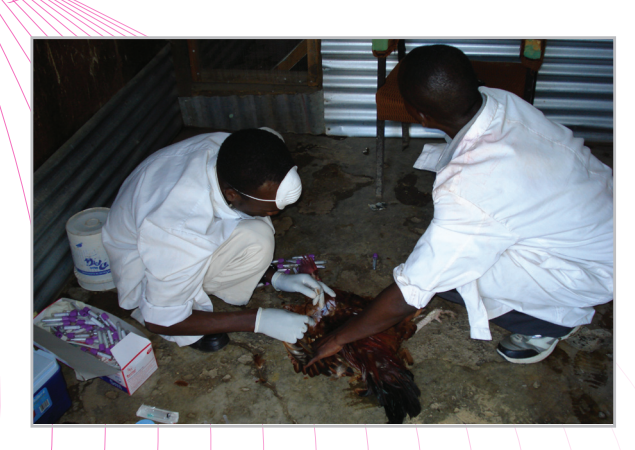
Blood sampling at IPRU

The symptoms of Newcastle managed to conceal themselves until few days after the birds had been introduced into