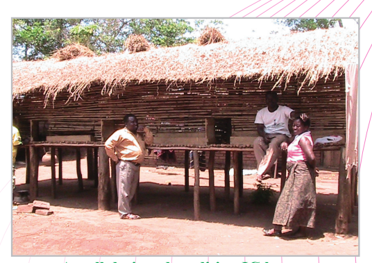
A well designed tradition IC house identified in Lilongwe

InCIP-Malawi has embarked on several crucial activities. For instance there has been identification of solutions to IC challenges e.g. sourcing and distributing Black Australorp, a dual purpose exotic chicken into village chicken without any documented protocol to guide farmers. To ensure mutual benefit between the participating stakeholders as well as encourage team work, a first stakeholder meeting was held on 14th September, 2012 at Bunda College. Stakeholders in the